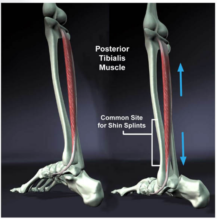
Normal Arch: note relaxed position of muscle and height of arch